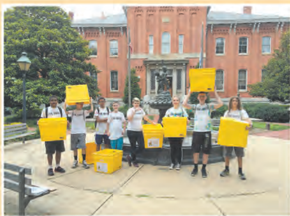
Summer Serve participating in Stuff the Bus