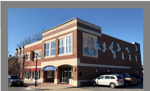
Bernard Brown Community Center 629 N Market St Frederick, MD 21702